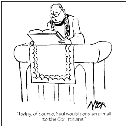
"Today, of course, Paul would send an e-mail to the Corinthians."

Father, you have appointed your Son Jesus Christ eternal High Priest. Guide those he has chosen to be ministers of word and sacrament and help them to be faithful in fulfilling the ministry they have received. Grant this through our Lord Jesus Christ, your Son, who lives and reigns with you and the Holy Spirit, one God, for ever and ever. Amen.